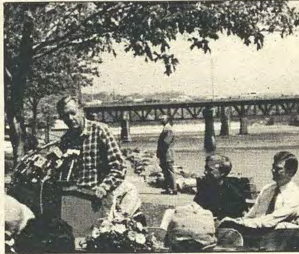
Interior Secretary Bruce Babbitt addresses the gathering

The agreement signed at the ceremony stipulates that Edwards manufacturing will transfer the entire dam facility to the State of Maine. A fund of $7.25 million contributed by Bath Iron Works and the Kennebec Hydro Developers Group (all private sources) will be used to remove the dam and embark upon a fisheries restoration project for the Kennebec. This fund will be managed by the National Fish and Wildlife Foundation. Bath Iron Works made a 2.5 million dollar contribution towards Dam removal as part of the mitigation plan that is required by state and federal agencies in connection with the shipyard's planned 17-acre expansion into the