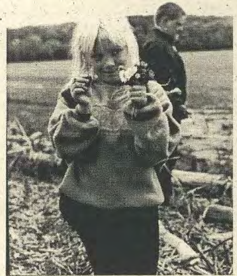
A student from Jordan Acres School in Brunswick observing the flowers at Merrymeeting Wildlife Management Area in Bowdoinham