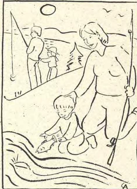
drawing by Charlotte Agell

island so you can leave when you like. If you can't do this, let FOMB know in advance so we can try to arrange specific IF&W ferry times for you. We will try our best to accommodate your schedule but try to be as flexible as you can because there are a limited number of rangers on the island and they have many jobs to do.